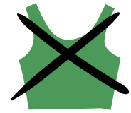
No Singlets or Crop Tops

Monday 6 th July - Incursion - Build-A-Bear- Join us at OSHC for a fun-filled Build-A-Bear experience! Each child will have the opportunity to create their very own bear, decorate a special t-shirt for their new furry friend, and decorate their own bear condo to take home!