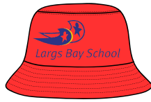
Red OSHC Hat