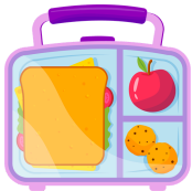
Recess and Lunch